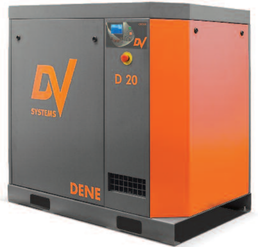
D20 Base Mounted

Innovative component integration results in a compact, quiet air system engineered for efficiency & performance providing high-capacity air delivery and stable system pressure with minimal installation space.